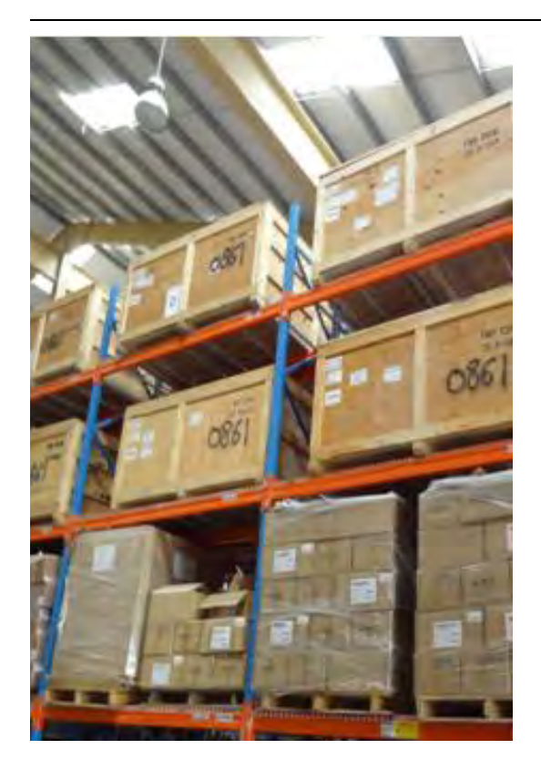
Storage crates at the ANA Central Supply Depot, Kabul.

The U.S. and coalition partners provide weapons to the ANSF according to the quantity and type agreed upon in the Tashkil-the Afghan government's official list of requirements for the ANSF. The Tashkil has changed over time, with some weapons requirements increasing and others decreasing. SIGAR found that, as of November 2013, more than 112,000 weapons provided to the ANA and ANP exceed requirements in the current Tashkil. In some cases, excess weapons were provided because ANSF requirements changed. For example, the ANA has 83,184 more AK-47s than needed because, prior to 2010, DOD issued both NATO-standard weapons, such as M-16s, and non-standard weapons, such as AK-47s. After 2010, DOD and the Afghan Ministry of Defense determined that interoperability and logistics would be enhanced if the ANA used only NATO standard weapons. Subsequently, the requirement was changed. However, no provision was made to return or destroy non-standard weapons, such as AK-47s, that were no longer needed. DOD officials told SIGAR that they do not currently have the authority to recapture or remove weapons that have already been provided to the ANSF.