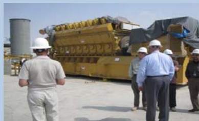
USAID, Black & Veatch, and SIGAR staff visit to the Kabul Power Plant

For more information contact: SIGAR Public affairs at (703) 602-8742 or PublicAffairs@sigar.mil