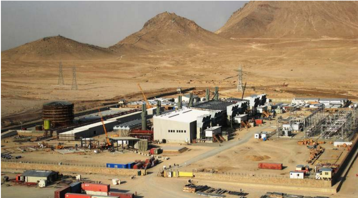
Photo of Kabul Power Plant as of October 21, 2009