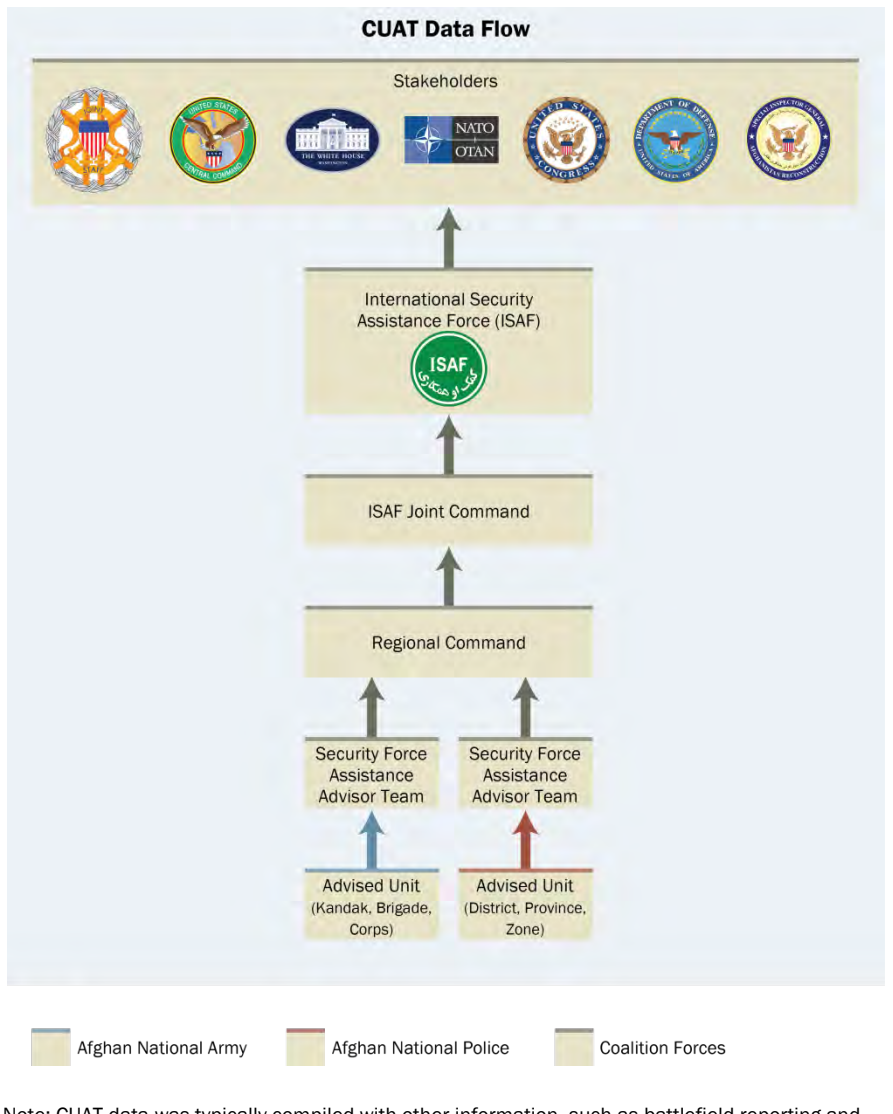
Figure 1 - Flow of ANSF Assessment Data

Note: CUAT data was typically compiled with other information, such as battlefield reporting and commander's assessments, to develop an overall assessment of the ANSF.