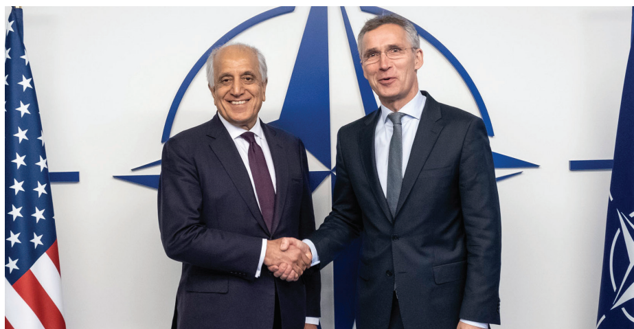
The United States Special Representative for Afghanistan Reconciliation, Ambassador Zalmay Khalilzad, left, visits NATO and meets with NATO Secretary General Jens Stoltenberg

Since the last edition of SIGAR’s strategic plan, the most conspicuous change in Afghanistan has been the talks between representatives of the United States and the Taliban insurgency on arrangements for an intra-Afghan dialogue that could bring an end to some 18 years of war. In July 2019, U.S. Special Representative for Afghanistan Reconciliation Zalmay Khalilzad declared “substantial progress” on four principal topics: counterterrorism assurances, foreign troop withdrawal, intra-Afghan dialogue and intra-Afghan negotiations, and a permanent and comprehensive ceasefire. 1 In late August 2019, U.S. and Taliban negotiators concluded a ninth round of discussions in the Gulf state of Qatar and Ambassador Khalilzad declared “We are at the threshold of an agreement” to reduce violence and open the door for intra-Afghan dialogue. Fighting had continued throughout the talks, which did not include direct participation by the elected government in Kabul. 2 However, discussions came to a halt after a Taliban attack in Kabul that killed 12 people, including a U.S. soldier, prompted President Donald J. Trump