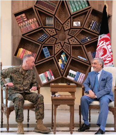
Marine Corps Gen. Joe Dunford, chairman of the Joint Chiefs of Staff, meeting with Afghan Chief Executive Abdullah Abdullah at the Sepidar Palace July 25, 2019.

Afghanistan is a difficult and complex environment. Uncertainties surrounding the security, governance, and economic transitions could significantly affect the future of the U.S. involvement in Afghanistan, along with SIGAR's oversight of the U.S.-funded reconstruction effort. Because of these uncertainties, SIGAR's strategic plan includes a number of key planning assumptions. SIGAR will monitor conditions to determine whether developments affect the validity of its assumptions and warrant adjusting its strategic plan. Current assumptions are: