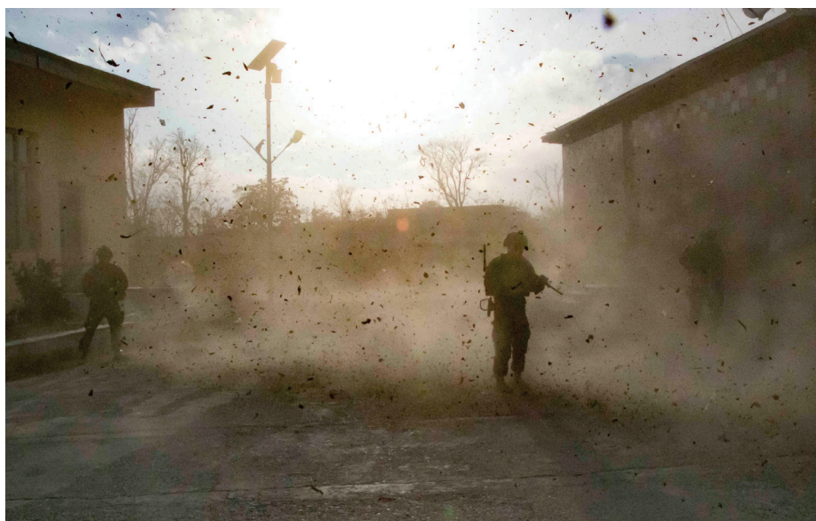
CH-47 Chinook helicopter kicks up dust during ongoing security efforts in Southeastern Afghanistan