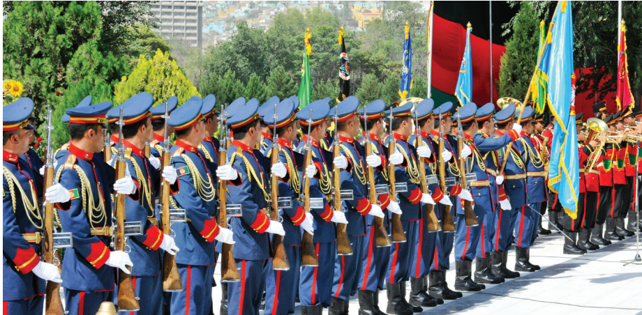
Afghan armed forces Honor Guard members participate in an Afghanistan Independence Day ceremony in Kabul, Afghanistan. Afghanistan declared its independence Aug. 19, 1919.

SIGAR is also required to coordinate with, and to receive cooperation from, the Inspectors General of USAID and the Departments of Defense and State. These inspectors general, SIGAR, and other federal oversight agencies constitute the Overseas Contingency Operations Planning Group, which meets quarterly to coordinate federal oversight activities related to Overseas Contingency Operations. 15