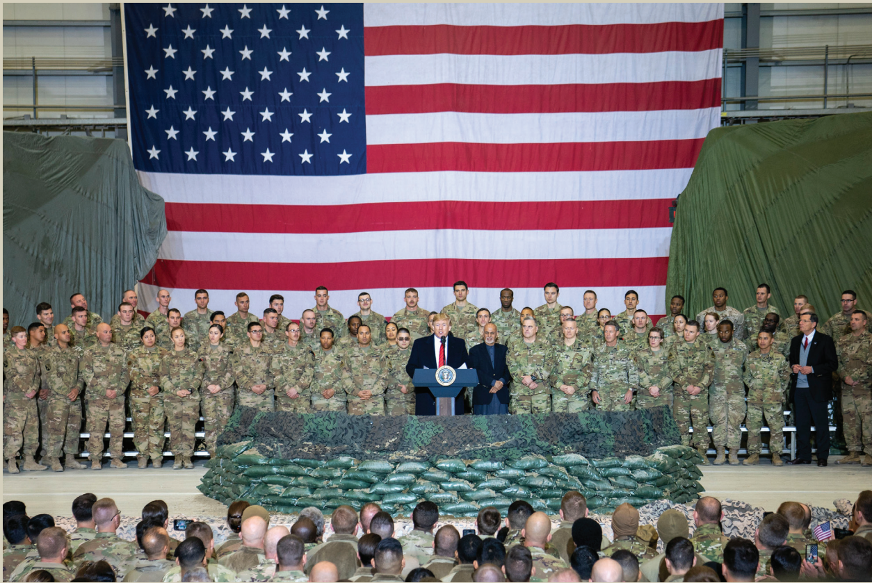
President Donald J. Trump addresses U.S. troops on November 28, 2019, at Bagram Airfield, Afghanistan.