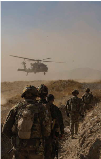
Afghan National Army soldiers conduct clearance operations in Southeastern Afghanistan

to call off peace negotiations on September 7. 3 President Trump announced the resumption of peace negotiations with the Taliban during his visit to Afghanistan over Thanksgiving. 4