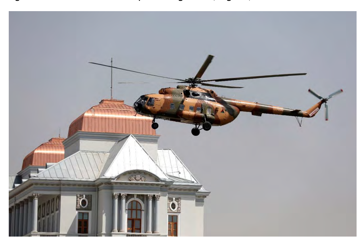
Figure 2: President Ghani's Helicopter Landing in Kabul, August 2, 2021

Around 2 p.m., some of the president's most senior staff who had remained at the palace made their way to the palace's helicopter landing zone (see Figure 1), believing that the president would stay behind as they departed.<sup>20</sup> Waiting for them at the landing zone were three of the four Mi-17 helicopters allocated for Ghani's movements (see example in Figure 2). According to two former senior officials, these three helicopters were configured for VIP travel and designed to hold approximately nine passengers each. The fourth helicopter in the fleet, which was at the Kabul airport at the time, was configured to carry the president's large protective detail (up to 26 people) wherever he flew (see Figure 3 on page 8).<sup>21</sup>