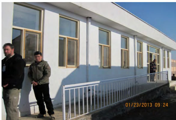
Qala-I-Muslim Medical Clinic Entrance.

SIGAR recommends that the Commanding General, U.S. Forces-Afghanistan, direct the appropriate force elements to (1) ensure that project documentation related to CERP projects complies with CERP guidelines and (2) periodically review the CIDNE database to ensure that all required project files are uploaded. In commenting on a draft of this report, U.S. Forces-Afghanistan concurred with our recommendations. U.S. Forces-Afghanistan's comments are presented in appendix IV.