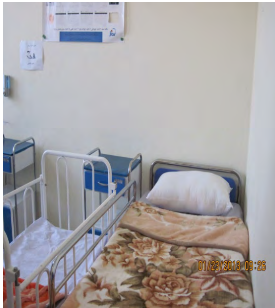
Photo 2 - Post-Natal Room