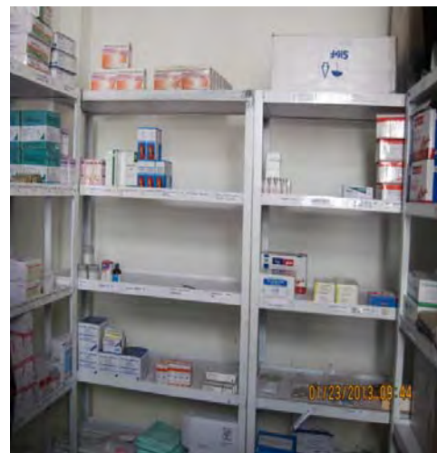
Photo 3 - Pharmaceutical Supply Room

Based on our inspection, the Ministry of Public Health is fulfilling its commitment to sustain the medical clinic. For example, light switches worked, floors were clean, bedding was plentiful and well kept, heating system worked, windows and doors were operable, and the pharmacy was well stocked. Photo 3 shows the pharmacy's stocked supply room.