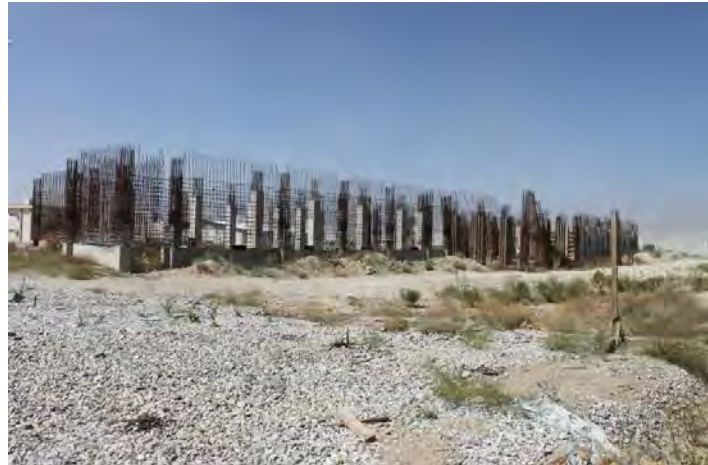
Photo 3 - Courthouse at Justice Center in Parwan Is Incomplete More than 1 Year After Completion Date

In October 2013, we reported that construction of the $2.38 million courthouse at the Justice Center in Parwan experienced poor project workmanship and oversight that resulted in it being incomplete and not constructed in accordance with contract requirements and applicable construction standards. Our review of documents revealed that the project experienced inadequate oversight and significant project delays from the time construction started in July 2011. Two months after construction began, the project was already behind schedule, and only 4 percent of the courthouse had been completed (see photo 3). We found no evidence that the U.S. contracting officer's representative conducted required quality assurance reviews. During our May 2013 site visit, we observed numerous cracks in the concrete, incomplete concrete pours, and rebar bound with wire instead of being welded, which could lead to structural failure.