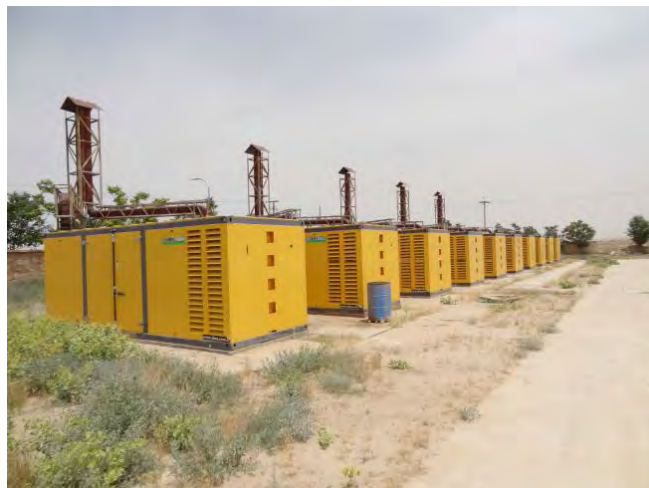
Photo 2 - Unused USAID-Funded Generators at Gorimar Industrial Park

We reported that as of May 29, 2014, nearly 6 years after USAID transferred Gorimar Industrial Park to the Afghan government, only 4 of 22 possible businesses—fewer than 20 percent—occupied the park. An Afghan government official responsible for managing the park said the four businesses together employed about 200 people. The official told us the lack of electricity and water had been the primary reasons more businesses had not moved into the park. Although the park's 10 generators, which cost a total of $2.5 million, were expected to be the primary source of power until the industrial park was connected to the local electrical grid, they were never made operational (see photo 2). The installed power generators and electrical distribution system appeared to be in good condition, but we could not confirm that they were operational because an Afghan government official said his agency did not have the funds needed to purchase fuel for the generators. This official also noted that the lack of electricity and water was another contributing factor to the industrial park's low occupancy rate. Although we were able to