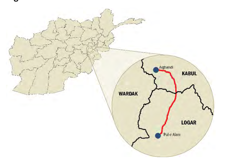
Figure 1 - NEPS I Transmission Line Route from the Arghandi Substation to the Pul-e-Alam Substation