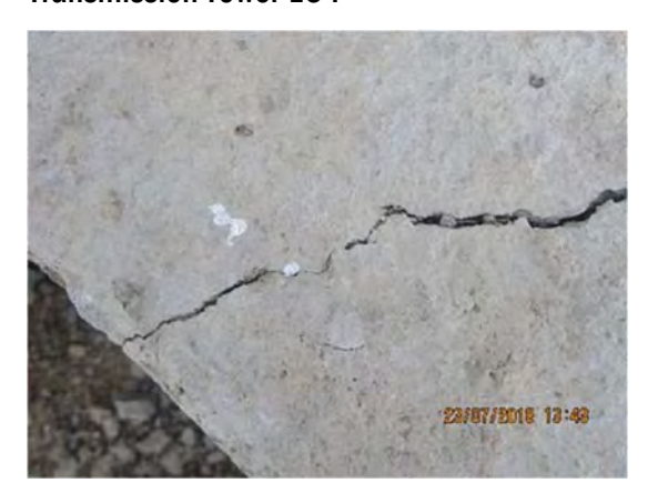
Photo 4 - Cracks in the Concrete Foundation of Transmission Tower 154