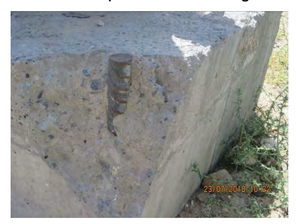
Photo 3 - Concrete Foundation of Transmission Tower 72 with Exposed Steel Reinforcing Rod