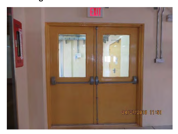
Photo 7 - Door in Pul-e-Alam Substation Without Fire Rating or Manufacturer's Label

We found that although USACE approved ACI's submittal for Omran Steel Tech manufactured doors, none of Omran Steel Tech's products were included on any of the certifying agencies' list of approved products.