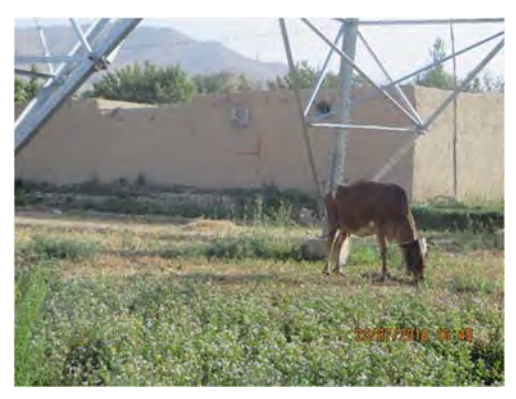
Photo 2 - NEPS I Transmission Tower 233 and Lines Crossing Near a Building