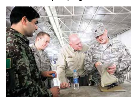
Photo 2 - CSTC-A Officials Inspect the Afghan Vendor's Factory in Spring 2010