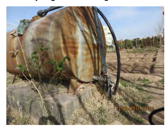
Photo 4 - Inoperable Irrigation System at Herat University's Agricultural College