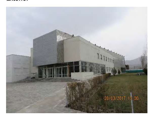
Photo 9 - International Center for Afghan Women's Economic Development Building Exterior