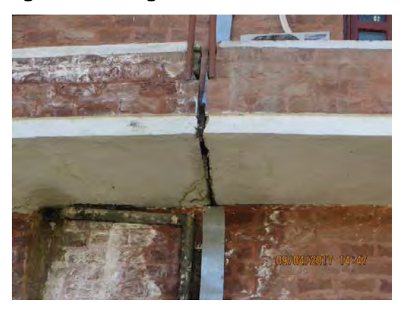
Photo 3 - Leaked Water Caused Nangarhar Agriculture College's Exterior to Crack

Similarly, TFBSO obligated $7.3 million as a grant to the Borlaug Institute to build and equip an Agricultural College at Herat University. 92 As part of this project, the Borlaug Institute installed an irrigation system to be used by the college in teaching irrigation techniques. We visited Herat University on March 12, 2017, and confirmed that the college and irrigation system had been completed. However, we found that the irrigation system, shown in photo 4, is currently inoperable. The farm director in charge of the system told us that the college cannot sustain it without additional funding from the Ministry of Higher Education.