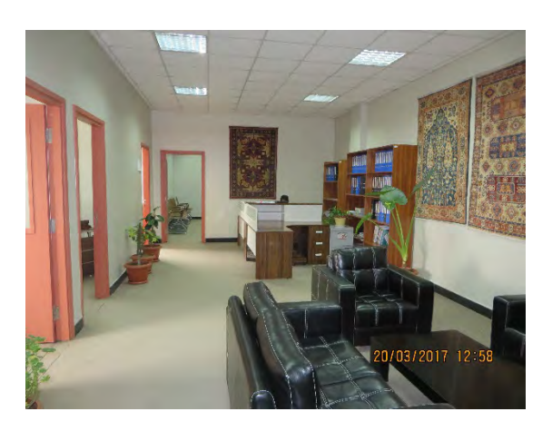
Photo 10 - International Center for Afghan Women's Economic Development Offices