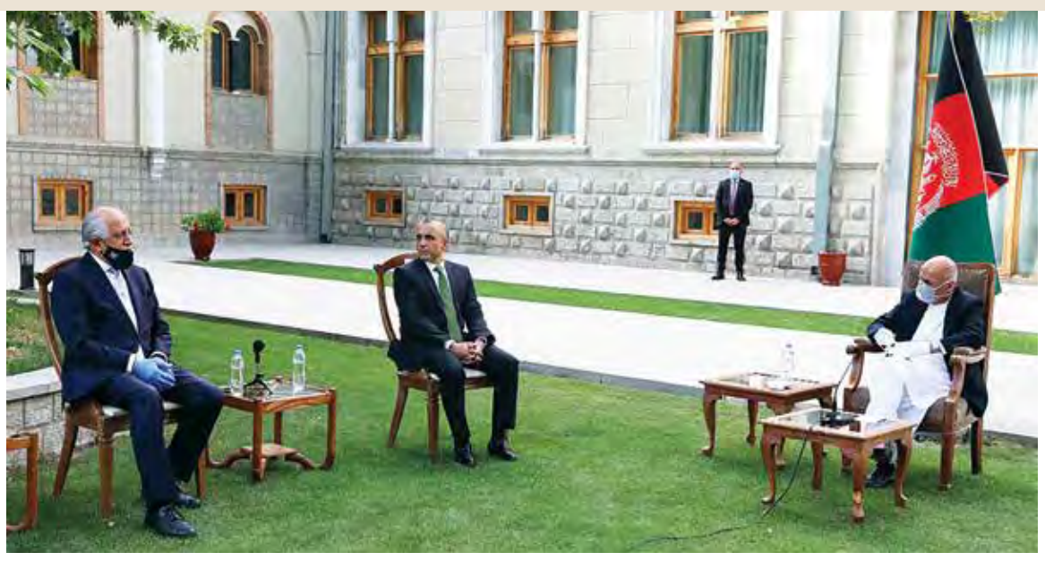
U.S. Special Representative for Afghanistan Reconciliation Zalmay Khalilzad (left) discusses the peace process with President Ghani (right) on June 10, 2020.

May 1, 2021, if the Taliban meet a number of conditions. The agreement commits the Taliban to prevent its members and other individuals or groups from using Afghan soil "to threaten the security of the United States and its allies," to enter into negotiations with the Afghan government to determine "the date and modalities of a permanent and comprehensive ceasefire," and to reach "agreement over the future political roadmap of Afghanistan."52 For a breakdown of each parties' commitments in the agreement, see page 7.