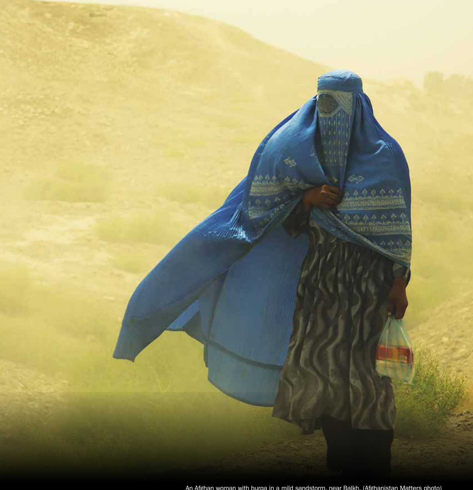
An Afghan woman with burqa in a mild sandstorm, near Balkh.