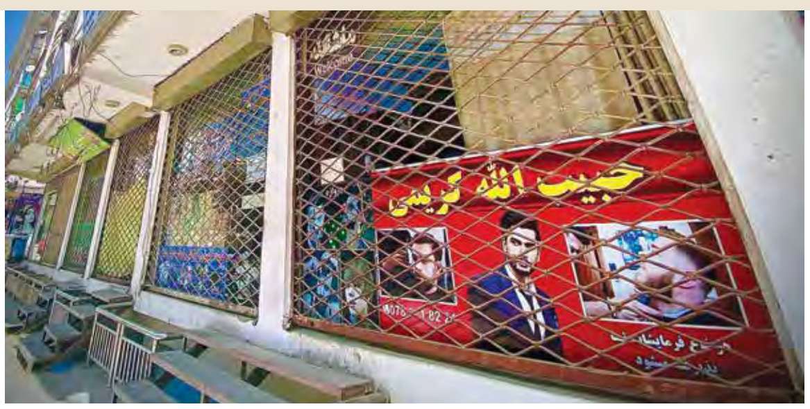
Shuttered shops in Kabul during the COVID-19 lockdown.

proper maintenance, possessed damaged or substandard medical-waste incinerators, and reported shortages of female staff to allow for the treatment of female patients in accordance with Afghan customs.200