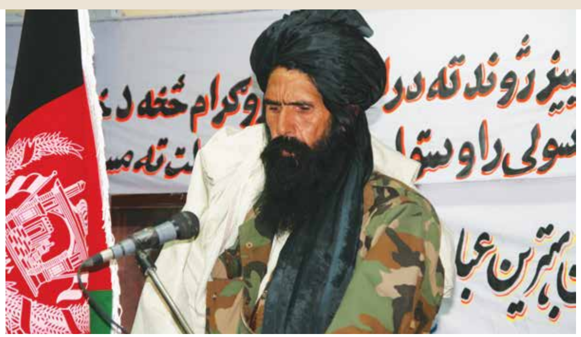
Reintegrated insurgent leader Ghaffar Tufaan.