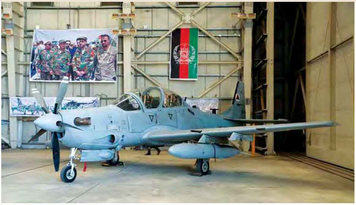
The A-29 Super Tucano is one of several types of aircraft deployed by the Afghan Air Force.

Afghanistan's security and stability, by extending their financial sustainment of the ANDSF through 2024, although they did not specify at what levels. 73 It is also unclear how adjustments to U.S. financial contributions to Afghanistan might impact NATO and other Coalition countries' commitments.