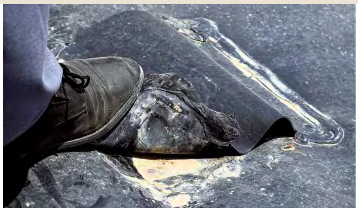
Detached pond liner air vent at a wastewater treatment facility.

food-assistance project or partner locations due to insecurity. ^{\rm 321}