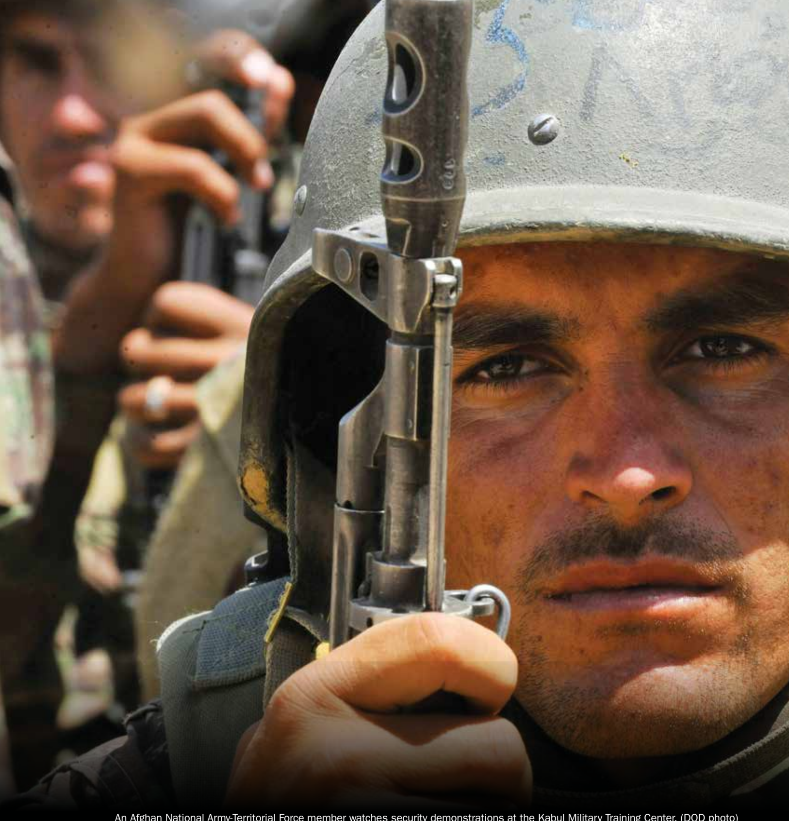
An Afghan National Army-Territorial Force member watches security demonstrations at the Kabul Military Training Center.