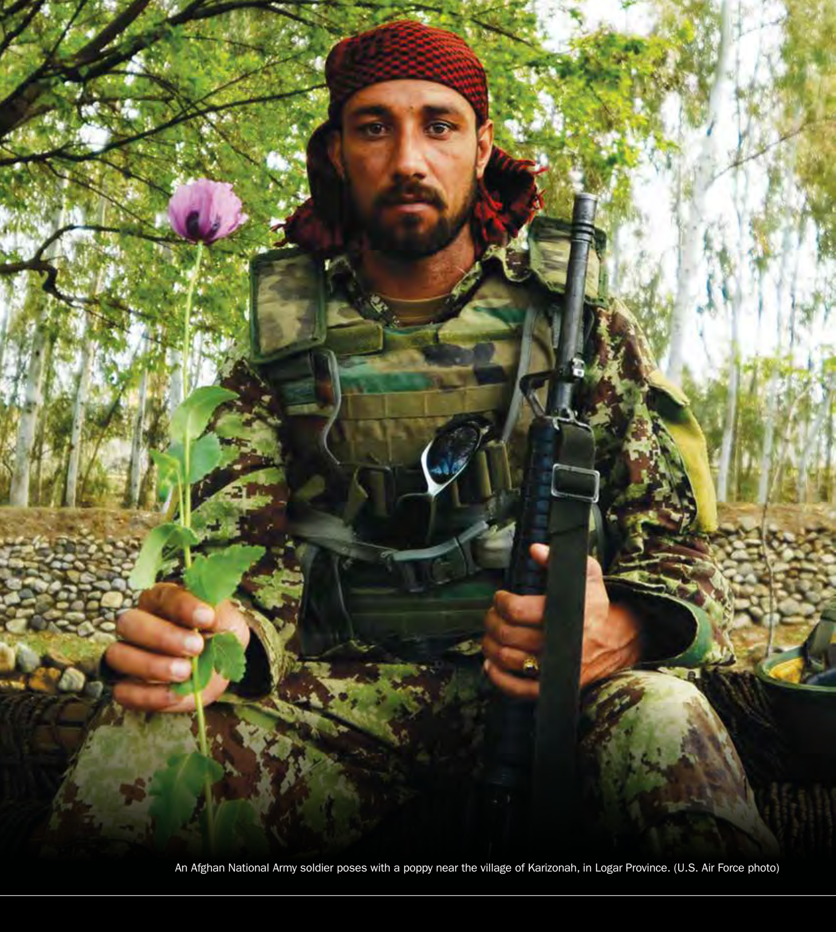
HIGH-RISK AREA 6