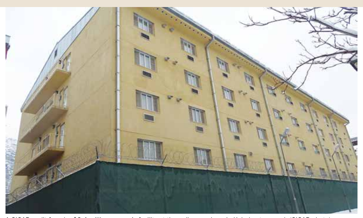
A SIGAR audit found a $6.4 million women's facility at the police academy in Kabul sat unused.

required annually for a viable Afghan state to operate. <sup>296</sup>