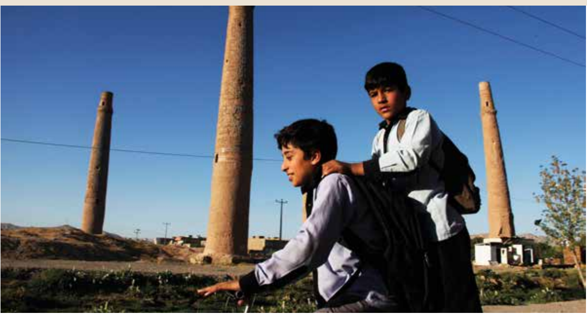
Daily life in Herat, Afghanistan.

equipment, and training for the approximately 305,000 members of the Afghan National Defense and Security Forces (ANDSF).<sup>23</sup>