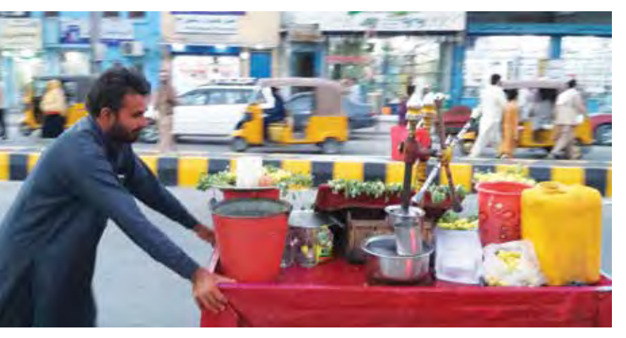
A lemon-juice vendor pushes his cart in Jalalabad, capital of Nangarhar Province.

of the nation's $11 billion in public expenditures (estimates for total on-budget and off-budget assistance). <sup>29</sup> On-budget donor funds are those included in the Afghan national budget and managed through Afghan government systems. Off-budget funds are those that do not meet the conditions of on-budget assistance. <sup>30</sup>