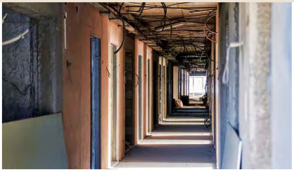
A U.S.-supported hotel-construction project left a security threat—an unfinished building overlooking the U.S. Embassy compound in Kabul.

or misappropriate procurements made with on-budget funds.<sup>304</sup>