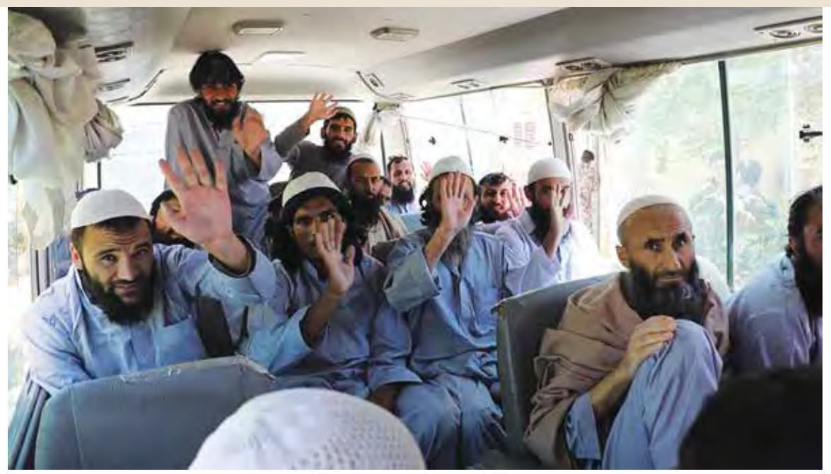
Taliban prisoners released by the Afghan government as a confidence-building measure.

further developments in the intra-Afghan negotiations before committing to a particular reintegration approach. If so, their restraint is consistent with SIGAR's warning that "a reintegration program runs a high risk of failure in the absence of a political settlement or peace agreement."151 Further, the latest World Bank public post-peace funding document does not include the cost of disarmament, demobilization, and reintegration programming in their projected funding estimates. 152 However, it may be prudent to continue preliminary planning for such a program in anticipation of a possible peace agreement.