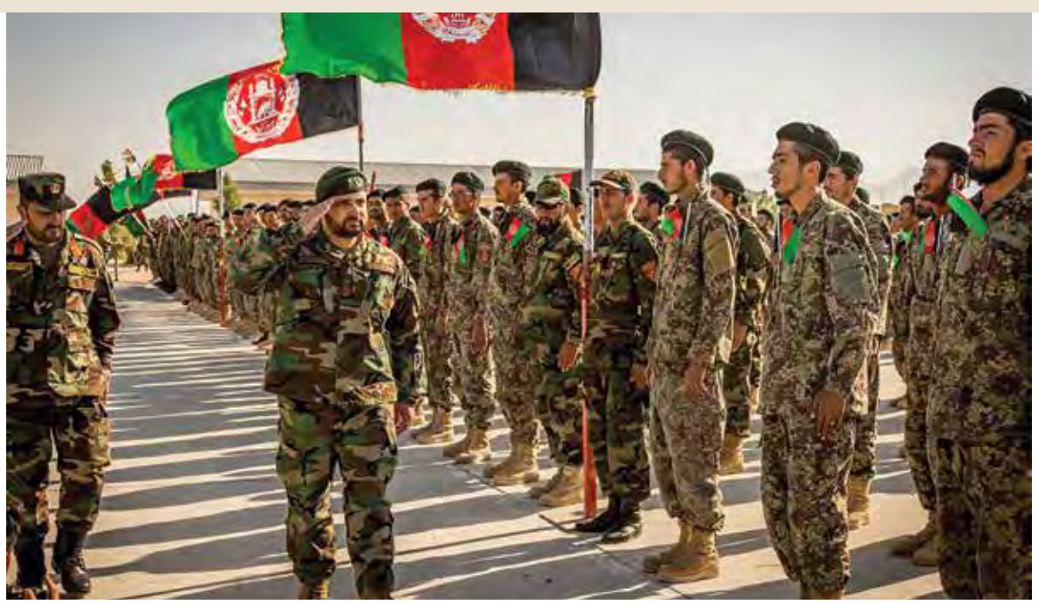
An officer reviews Afghan soldiers graduating basic warrior training.