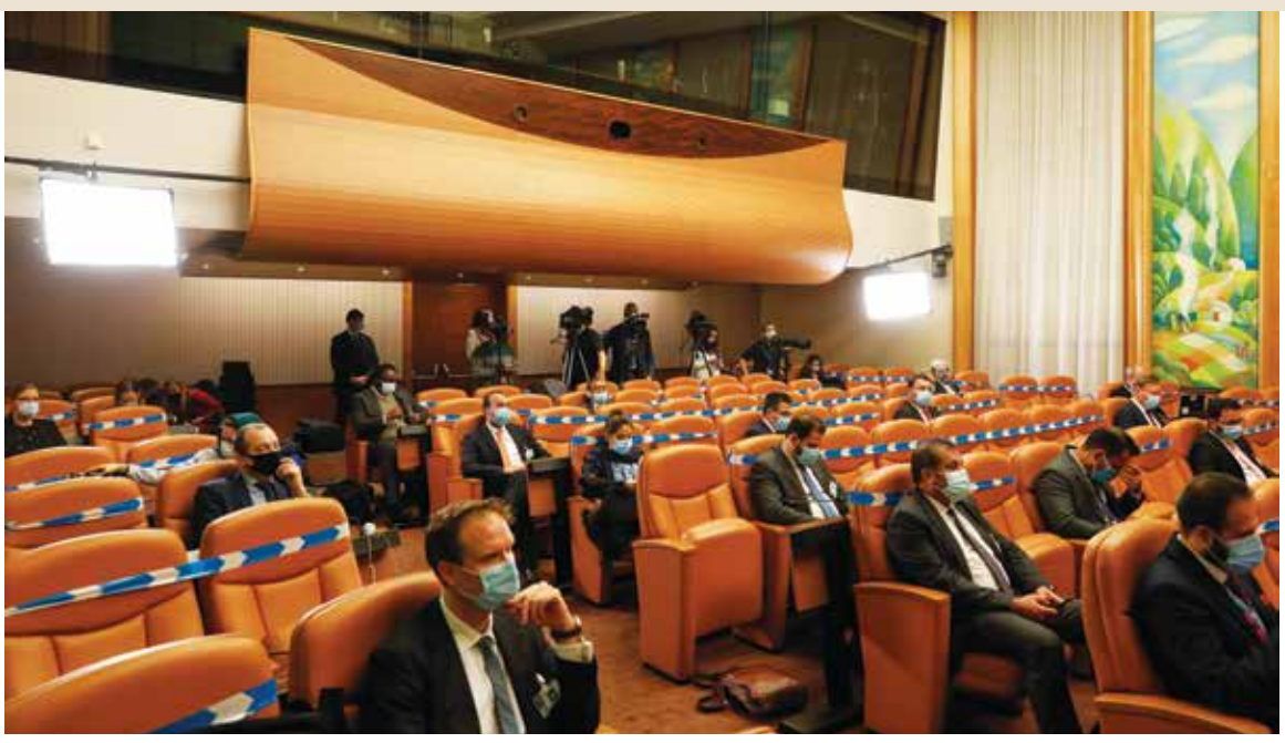
Socially distanced press event at the 2020 Afghanistan Conference in Geneva, Switzerland.

The ODI authors advocate concentrating any development-assistance cuts in off-budget activities in order to retain on-budget funding. According to the authors, cuts in off-budget activities are unlikely to have major or immediate impacts on growth compared with cuts to on-budget expenditures managed by the Afghan government.121 As discussed in more detail on pages 56-58, SIGAR's experience shows that as the United States provides more reconstruction funds on-budget, whether through bilateral transfers or disbursement via multilateral trust funds, it will be vital that Afghan ministries have strong accountability measures and internal controls in place because external visibility into the use of funds is likely to shrink. 122