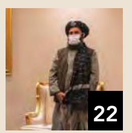
HIGH-RISK AREA 2: Uncertain Funding for a Post-Peace Settlement