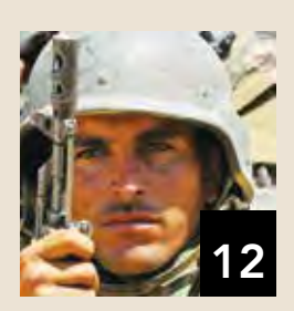
HIGH-RISK AREA 1: Increasing Insecurity