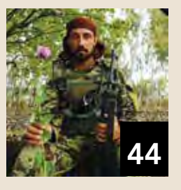
HIGH-RISK AREA 6: Illicit Narcotics Trade