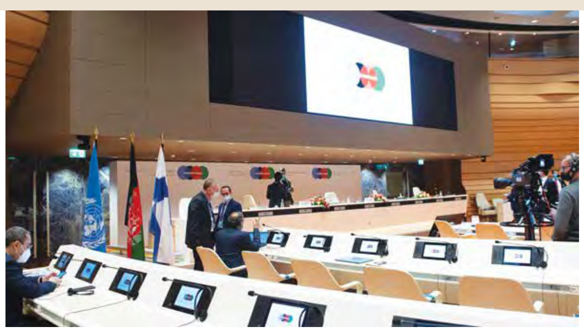
Donor and Afghan government representatives prepare to discuss corruption during a side event of the 2020 Afghanistan Conference.

in the MCTF. DOJ reported at the time that a former MCTF director was found to be corrupt following an Afghan government investigation. Then in October 2020, SIGAR reported that the director of the MCTF was (again) removed following corruption allegations. According to the Combined Security Transition Command-Afghanistan (CSTC-A), several MCTF unit chiefs and investigators were corrupt and had extorted suspects in return for suppressing or nullifying cases. Further, CSTC-A reported collusion at the time between MCTF and Anti-Corruption Justice Center members as well as bribery with senior ministry officials. <sup>180</sup>