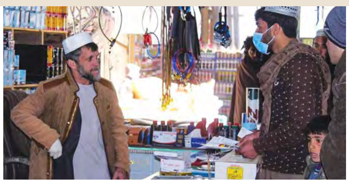
In Lashkar Gah, Helmand Province, the U.S.-supported Lincoln Learning Center shares public health information on COVID-19 with market vendors.

of the disease. While schools reopened in fall 2020, many students reported having little to no contact with teachers during the lockdown, with distance learning hampered by the lack of electricity and limited access to the internet. 207 At the end of 2020, the Ministry of Education reclosed schools as COVID-19 cases increased during a second wave of the disease. 208 Given the worsening economy and the pressure on students to find work to help support their families, among other challenges, many students may not find their way back into school. 209