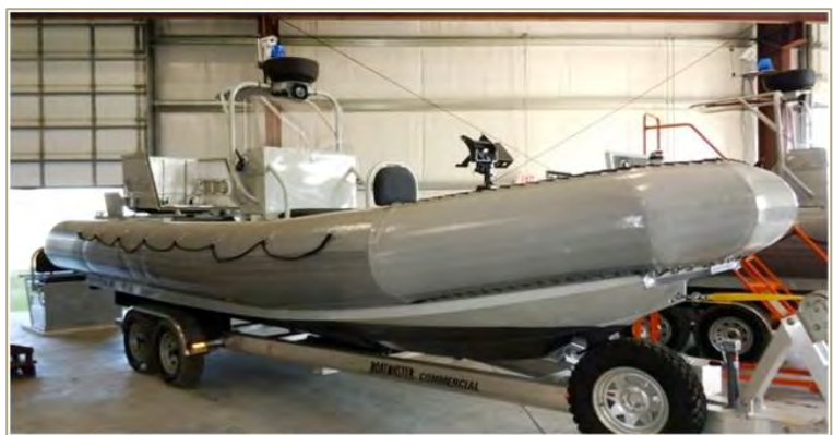
Figure 1 - One of the patrol boats purchased for the ANP