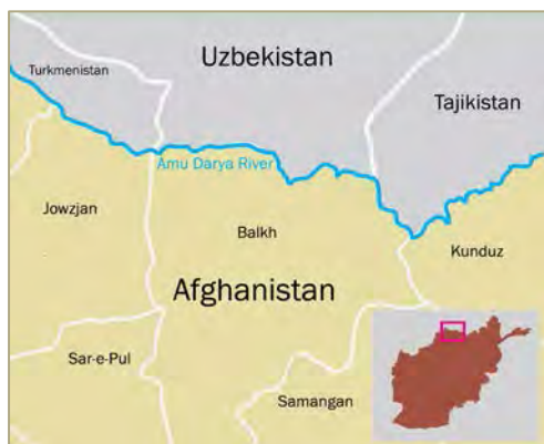
Figure 2 – Region where patrol boats were intended to operate

In response to the MOR, the Department of the Navy procured the patrol craft using the Afghanistan Security Forces Fund (ASFF). According to documents obtained by my office, in July 2011, CSTC-A cancelled the requirement for the patrol boats and requested that the contract be terminated and that the disbursed funds be returned. However, because 80 percent of the funds had been disbursed at the time of the requirement cancellation and the boats were nearly finished, it was decided that the contract should be allowed to proceed to completion. According to officials at the Defense Security Cooperation Agency (DSCA), the patrol boats were manufactured and delivered to the Navy in 2011 and have been in storage at the Naval Weapons Station/Cheatham Annex, Yorktown, Virginia ever since.