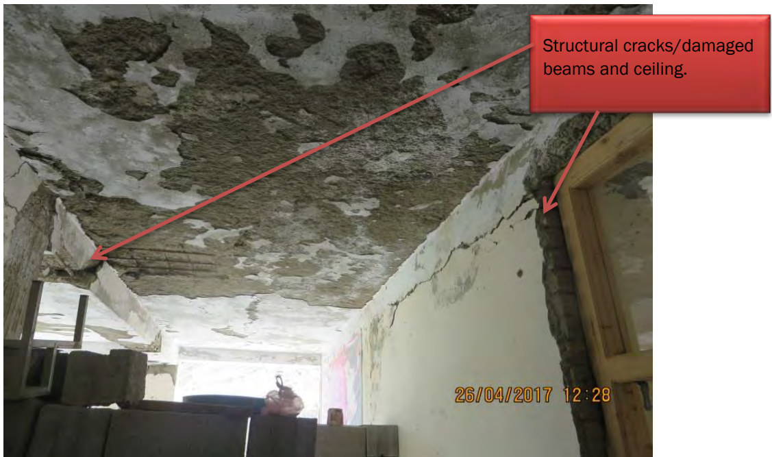
Source: SIGAR April 26, 2017.