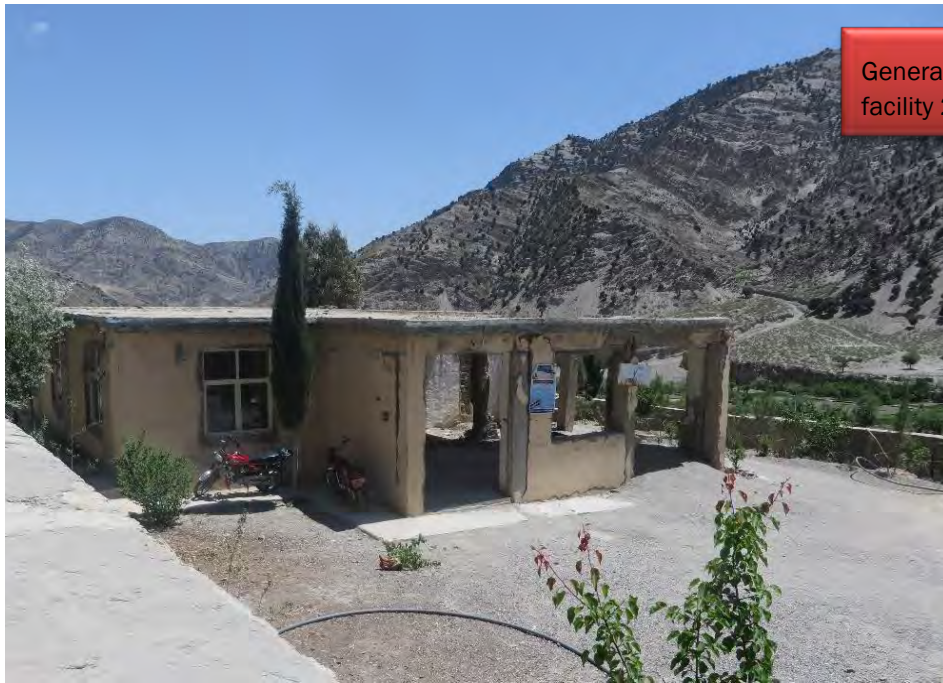
General View of health facility 2132