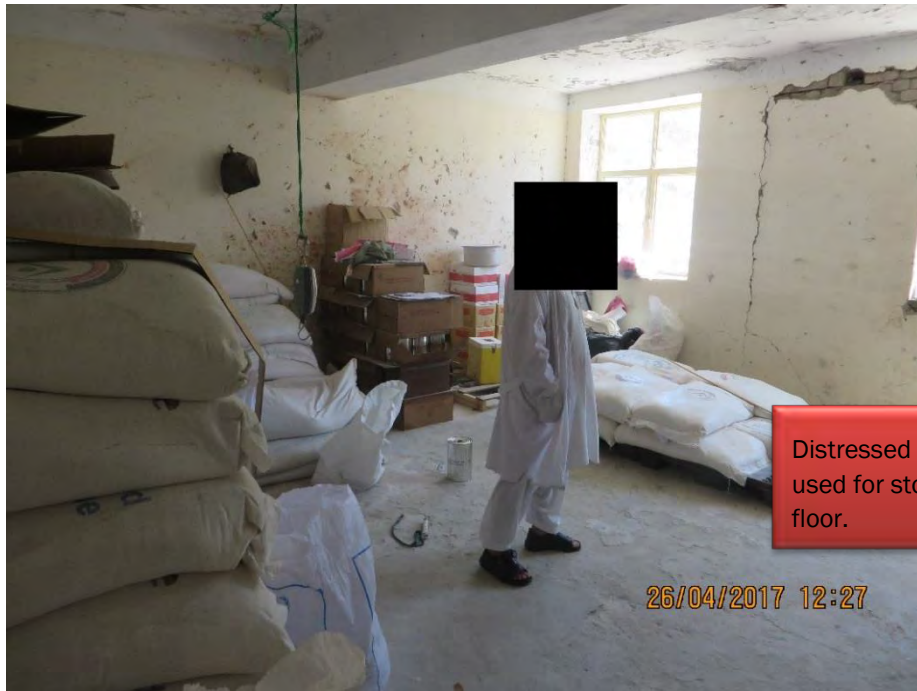
Source: SIGAR April 26, 2017.