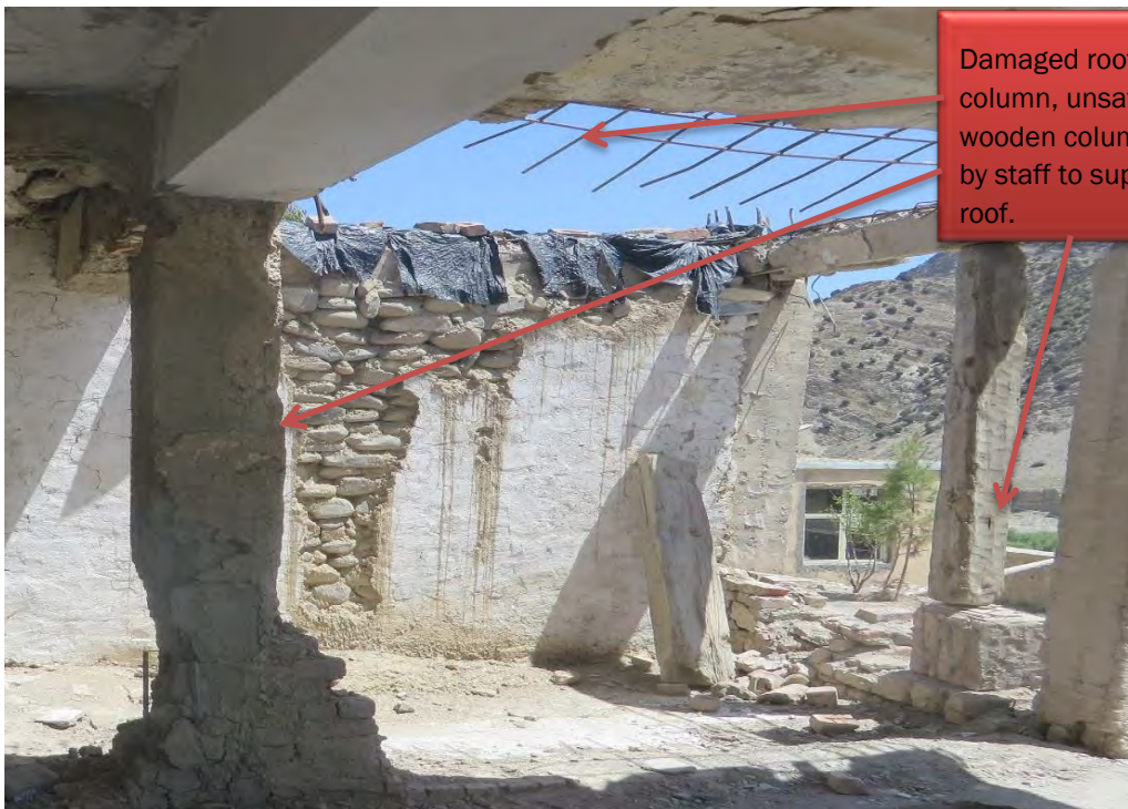
Damaged roof, beams and column, unsafe temporary wooden column installed by staff to support the roof.