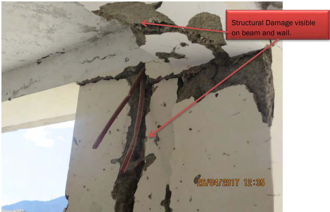
Source: SIGAR April 26, 2017.