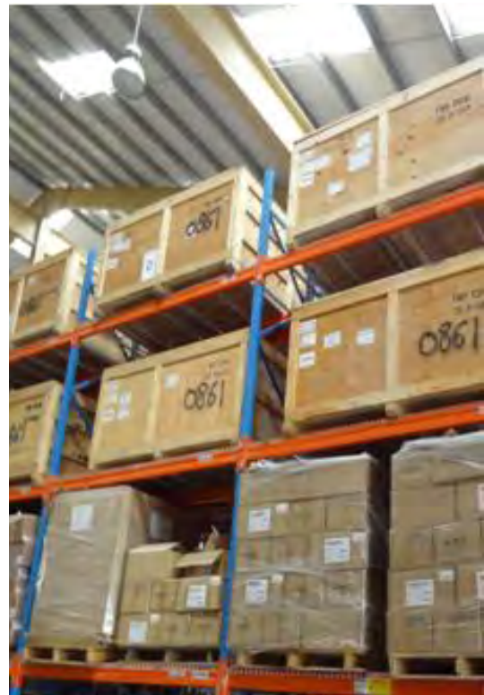
Storage crates at the ANA Central Supply Depot, Kabul.

The U.S. and coalition partners provide weapons to the ANSF according to the quantity and type agreed upon in the Tashkil—the Afghan government’s official list of requirements for the ANSF. The Tashkil has changed over time, with some weapons requirements increasing and others decreasing. SIGAR found that, as of November 2013, more than 112,000 weapons provided to the ANA and ANP exceed requirements in the current Tashkil. In some cases, excess weapons were provided because ANSF requirements changed. For example, the ANA has 83,184 more AK-47s than needed because, prior to 2010, DOD issued both NATO-standard weapons, such as M-16s, and non-standard weapons, such as AK-47s. After 2010, DOD and the Afghan Ministry of Defense determined that interoperability and logistics would be enhanced if the ANA used only NATO standard weapons. Subsequently, the requirement was changed. However, no provision was made to return or destroy non-standard weapons, such as AK-47s, that were no longer needed. DOD officials told SIGAR that they do not currently have the authority to recapture or remove weapons that have already been provided to the ANSF.