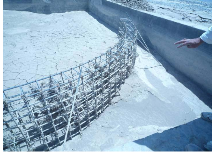
Photo 6: Reinforcement Bar Cage for a Concrete Arch in a Fabrication Pit

We also noted that weekly engineer reports required by the contract were not being provided. Such contractor quality control reports should include documentation such as material test results, the quality of stone, and verification that concrete reinforcement bars are properly positioned prior to concrete placements (see photo 6).