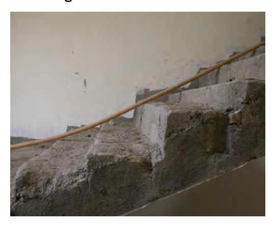
Photo 3 - Stairs of Different Heights and Crumbling at Garm Ser Site

In October 2010, we reported that construction at each of the six district headquarters being built under a $5.9 million USACE-administered project failed to meet contract and construction requirements. We found that the level of noncompliance at each site varied, but overall the construction was poor. Photo 3 shows stairs at the Garm Ser project site that are different heights and crumbling. Deficiencies identified were both extensive and unacceptable from a structural and safety standpoint. Problem areas included low-quality concrete and inadequate roofing installations. For example, inadequate concrete and foundation work called into question the structural integrity of the buildings and raised the risk of collapse. Most significantly, we observed structural issues that cast doubt on the facilities' ability to withstand an earthquake, as required by the contract. We also found numerous cases of product substitution in which lower-grade materials were