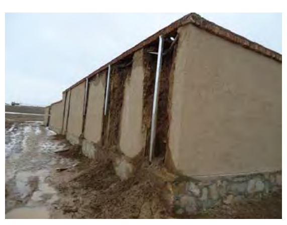
Photo 1 - Exterior View of Building Deterioration Due to Water Penetration