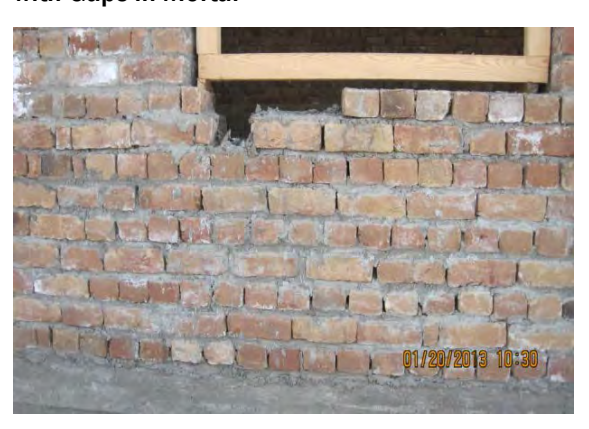
Photo 2 - School Building's Exterior Brick Wall with Gaps in Mortar

We reported that the Bathkhak School facility, which was under construction in Kabul province at the time of our inspection in 2013, was not being constructed in accordance with contract requirements. For example, instead of a single-story, 10-classroom building, we found two 5-classroom buildings were being built under this USFOR-A-administered project. We also found that the contractor substituted building materials without USFOR-A approval. In one instance, a concrete slab roof was installed instead of a wood-trussed roof, as required by the contract. This raised concerns because the school, which was to be occupied by hundreds of faculty and students, was located in an area of high seismic activity. Further, we found that the school appeared to have construction flaws that could compromise its structural integrity. For example, we found (1) large gaps between bricks in the walls that supported the concrete roof (see example in photo 2);