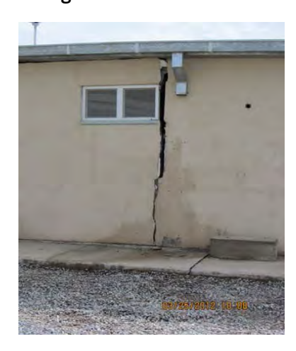
Photo 4 - Cracked Exterior of Latrine Building at ANA Garrison in Kunduz

In 2010, we reported that several structures at the ANA garrison in Kunduz were unsafe, uninhabitable, or unusable. The structures were being built under a $72.8 million contract administered by USACE. We observed severe ground settlement, roadbed cavities, and improper soil grading. We noted that the probable cause of these issues was a lack of adequate soil preparation and pointed out that soil problems were well known in the area. For example, German forces built a camp nearby and used soil replacement, elevated building pads, and drainage systems to counter the risk of collapsible soil. Our report stated, "To protect U.S. investment in the garrison and provide a functioning center for ANA troops currently housed in tents outside the garrison, the issues we observed—most critically, the soil settling and site grading-need to be addressed." However, in a 2012 follow-up inspection, we found that soil instability and structural failure of facilities continued to occur, with ANA soldiers now living on the compound. For example, we found a latrine building that had settled and cracked, and was unusable