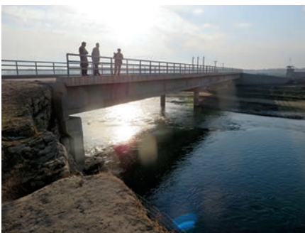
CERP-funded 70-meter long bridge in Baghlani Jadid District, Baghlan Province.

In response to these recommendations, USAID states that (1) it will inform the appropriate authorities within the MOE of the schools identified by SIGAR that lack water, have poor sanitation conditions, or show signs of structural damage and safety hazards, (2) USAID stated it would alert the MOE and the Parwan Provincial Education Director of the observed low attendance rates in the schools that SIGAR identified.