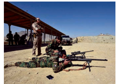
NATO advisor oversees ANA marksmanship training.