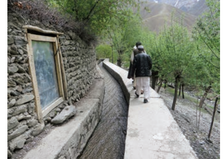
GPI-funded irrigation system in Warsaj District, Takhar Province.

The six Good Performers Initiative (GPI) projects examined in this report were funded by the State Department's Bureau of International Narcotics and Law Enforcement Affairs (INL). SIGAR conducted the site visits as part of an ongoing effort to verify the location and operating conditions of facilities built, refurbished, or funded by the U.S. as part of the reconstruction effort in Afghanistan. SIGAR found that INL's reported geospatial coordinates for the six projects were each within one kilometer from the actual project location. Additionally, SIGAR found that the two hostel building projects had missing and broken furniture, a general lack of facility maintenance and sanitation, and nonoperational dining facilities. Site visits to the four other projects indicated problems, such as a lack of clean water or well-maintained toilets, but each was functioning and fulfilling its intended purpose.