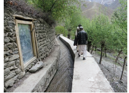
GPI-funded irrigation system in Warsaj District, Takhar Province.

The six Good Performers Initiative (GPI) projects examined in this report were funded by the State Department's Bureau of International Narcotics and Law Enforcement Affairs (INL). SIGAR conducted the site visits as part of an ongoing effort to verify the location and operating conditions of facilities built, refurbished, or funded by the U.S. as part of the reconstruction effort in Afghanistan. SIGAR found that INL's reported geospatial coordinates for the six projects were each within one kilometer from the actual project location. Additionally, SIGAR found that the two hostel building projects had missing and broken furniture, a general lack of facility maintenance and sanitation, and nonoperational dining facilities. Site visits to the four other projects indicated problems, such as a lack of clean water or well-maintained toilets, but each was functioning and fulfilling its intended purpose.