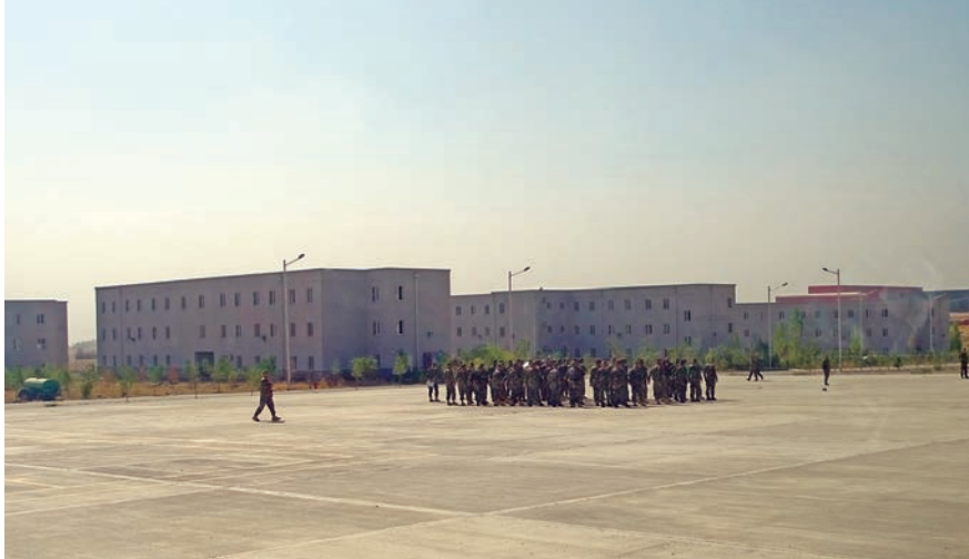
ANA soldiers stand in formation at the Marshal Fahim National Defense University.

to design and construct 85 buildings, support facilities, and other structures for MFNDU Phase I. After 18 contract modifications, the contract's value increased by $24.5 million to $94.7 million.