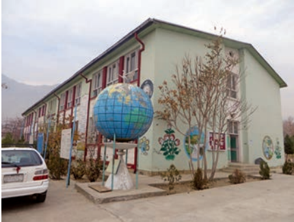
USAID-funded high school for girls in Parwan Province.