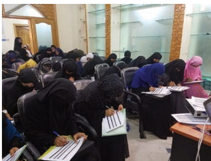
Afghan women attend a Promote class workshop.