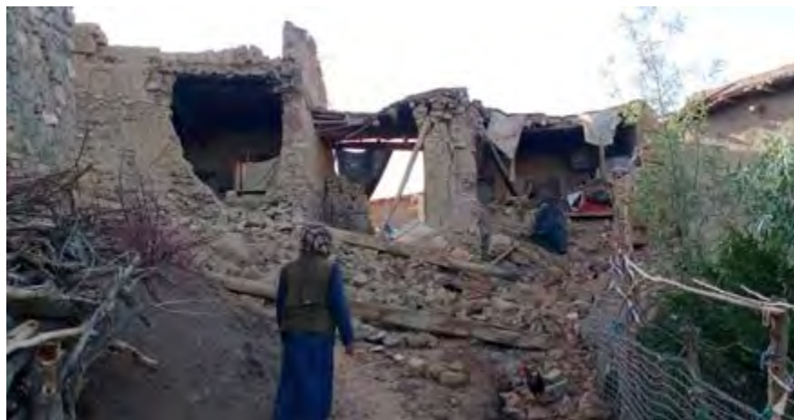
House destroyed by June 22 earthquake in eastern Afghanistan.

destroyed, this was Afghanistan's deadliest earthquake in two decades. 6 Homes made of stone and mud collapsed on sleeping families, leaving thousands homeless and without food or safe drinking water as the region weathers unseasonably cold temperatures. The UN has warned that such conditions could lead to a cholera outbreak. In mountainous Paktika Province, the epicenter of the earthquake, relief workers have only limited access to remote communities in need of food, medical aid, blankets, and shelter. Hospitals already struggling to address the hunger crisis have received a huge influx of patients injured in the earthquake. 7