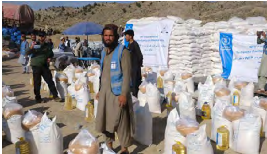
UN delivers aid in direct response to the June 22 earthquake, Giyan District, Paktika Province.