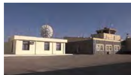
The control tower at the Herat International Airport.

Humanitarian and commercial flights continue to use KBL at considerable cost and risk, with an average of approximately 10 commercial flights per day from KBL to domestic airports and international destinations including the UAE, Pakistan, Saudi Arabia, Iran, Turkey, Uzbekistan, Qatar, Kuwait, Georgia, and Russia. Since December, commercial flight trackers have registered regular services to/from Kabul by flag carrier Ariana Afghan Airlines, privately owned Kam Air, and Iranian carriers Mahan Air and Taban Airlines. There are occasional charter flights and frequent