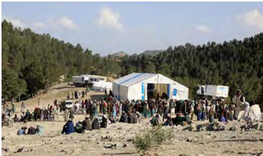
UN aid distribution center providing food and other supplies to communities affected by the June 22 earthquake.

household items; as well as assistance to provide for water, sanitation, and hygiene supplies to prevent waterborne diseases. 9