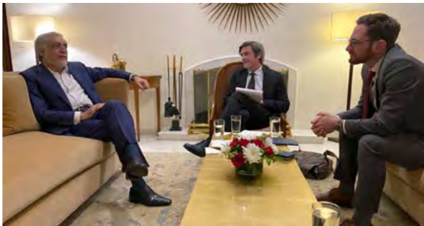
U.S. Special Representative for Afghanistan, Thomas West (far right) meets with Dr. Abdullah Abdullah (far left) on May 25, 2022.

USAID described several major obstacles that continue to impede the provision of aid in Afghanistan since the Taliban takeover. Hundreds of thousands of qualified Afghans—government officials, professionals, aid workers, intelligentsia, businesspeople, technocrats, and others—have fled the country. Some aid organizations have relocated all or most of their staff to other countries, and many organizations have left completely. Others are not yet sure how to work under the Taliban regime, since the group has not made clear how it will deal with aid groups helping Afghans with health care, education, agriculture, and poverty alleviation. USAID reports, “the world community pledged more than $1 billion in humanitarian aid to Afghanistan but delivering assistance to the most vulnerable people will require negotiations with the Taliban-led government, which has still not been internationally recognized.” 30