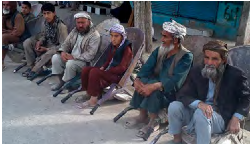
Daily wage laborers wait for jobs at an assembly point in Kunduz City, Afghanistan.

from political influence, but is not in a position to speculate on DAB officials' competence. 48