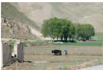
A farmer plows a field in rural Badakhshan Province.

gaps; increasing the resilience of the agricultural sector to satisfy domestic market demand; and increasing farm gate prices for targeted farming communities. Other activities to increase cultivation and yield include orchard rehabilitation and greenhouse construction in response to current strong demand for vegetables. Activities include training, technical assistance, and extension services to improve farm and orchard management and provision of inputs such as seeds, fertilizer, saplings, trellising, and greenhouses to grow and harvest fruits and vegetables. 82