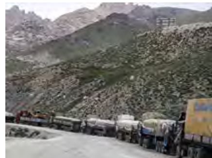
A long queue of trucks loaded with commercial goods proceeds to northern Afghanistan through Salang Pass in Parwan Province.

These vulnerable populations include internally displaced people (IDPs) and returnees living in settlements and other settings in and around urban centers; women and adolescent girls, including IDPs coming from rural