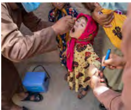
An Afghan child receiving a polio vaccine.

USAID does note some inconsistencies in women's access to health-care services between urban and rural areas. Access to health services is generally better in the cities due to the number of options and the presence of donor partners (ICRC, UHI, International Federation of the Red Cross/Afghan Red Crescent Society), the WHO and other UN agencies. UHI reports that in the majority of cases in urban settings, women are also able to access health services without a mahram —or male chaperone—and that women in the cities are not required to be accompanied by a mahram for distances of less than 48 miles. Meanwhile, AFIAT reports that women must be accompanied by a mahram if traveling more than 48 miles, and that women's access to health care differs across provinces. For example, in the Karz and Arghandab districts of Kandahar, women are forbidden from accessing health services without a mahram. In Nangarhar, women are allowed to access health services without a mahram in some districts, but not in others. And in Mazar-e Sharif, there appear to be no strictly enforced restrictions on women's access to health services. 129