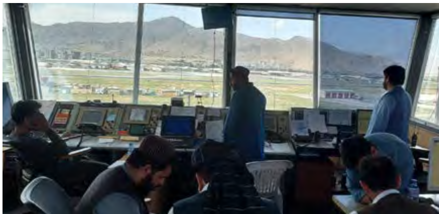
Inside the control tower at the Kabul International Airport.

operations from Islamabad by the UN Humanitarian Air Service/World Food Programme. 99