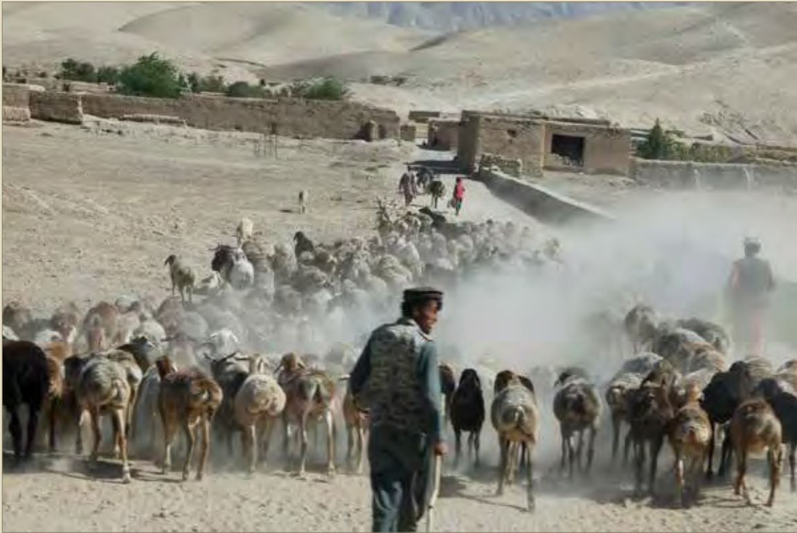
Shepherds in Kunduz Province take their sheep to pasture.