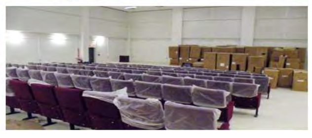
Figure 1 - Photos of the 64K building during a site visit on May 8, 2013. Top left: exterior view; top right: tactical operations center; bottom left: cubicles; bottom right: unopened boxes and unused chairs.